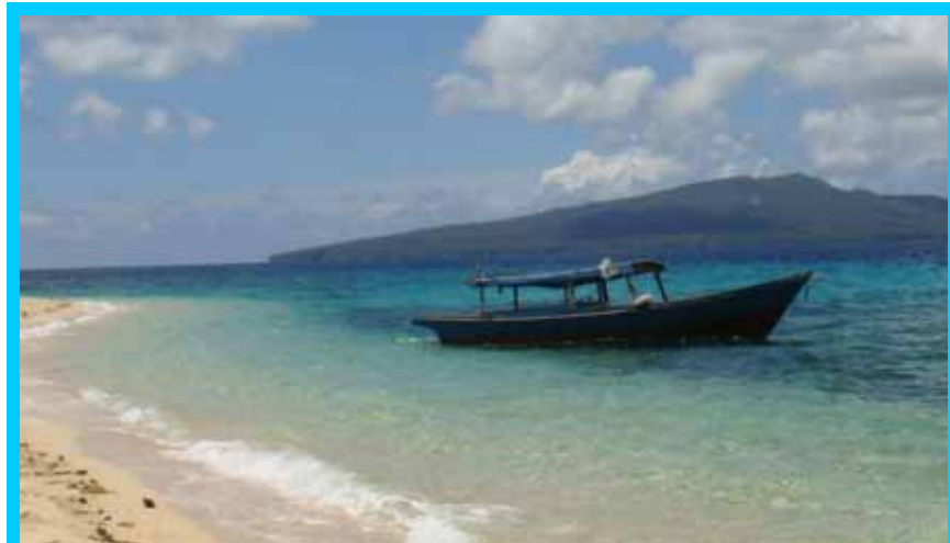
The Brothers take whatever transportation is available to find and treat the Mindanao lepers-in-hiding.