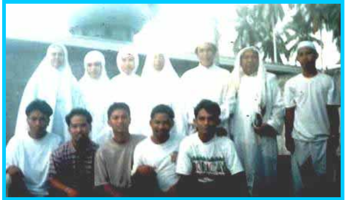
A meeting of the Brothers and a group of Muslims on Mindanao.