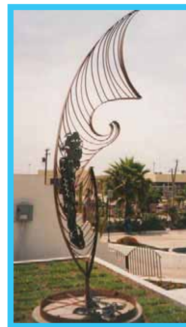
The sculpture, with symbols representing the Dominican Order and Baja California, located in the Mission History Garden of Ensenada's Riviera Cultural Center.