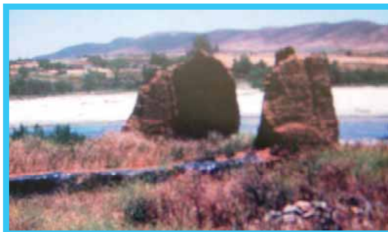
The present-day ruins of Mission San Vicente Ferrer, which are within the boundaries of the municipality of Ensenada, just north of the town of San Vicente.

you ever have the opportunity to visit Ensenada, do go see it in the Mission History Garden inside the newly-restored Riviera Cultural Center near the waterfront, and contemplate the work of our missionaries over two centuries ago--and the citizens' gratitude--that it represents.