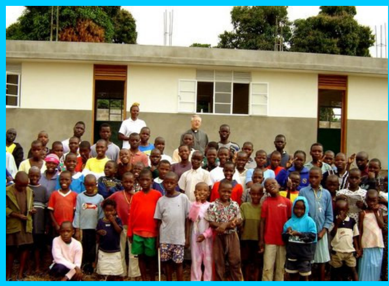
Through sponsorships, the Dominican Friars assist around 220 children, allowing them to attend school.