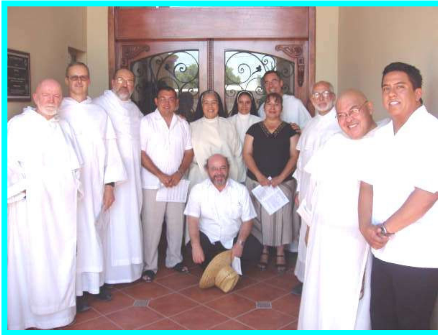
The visit of our Dominican Master General from Rome to inaugurate the new “Convento”